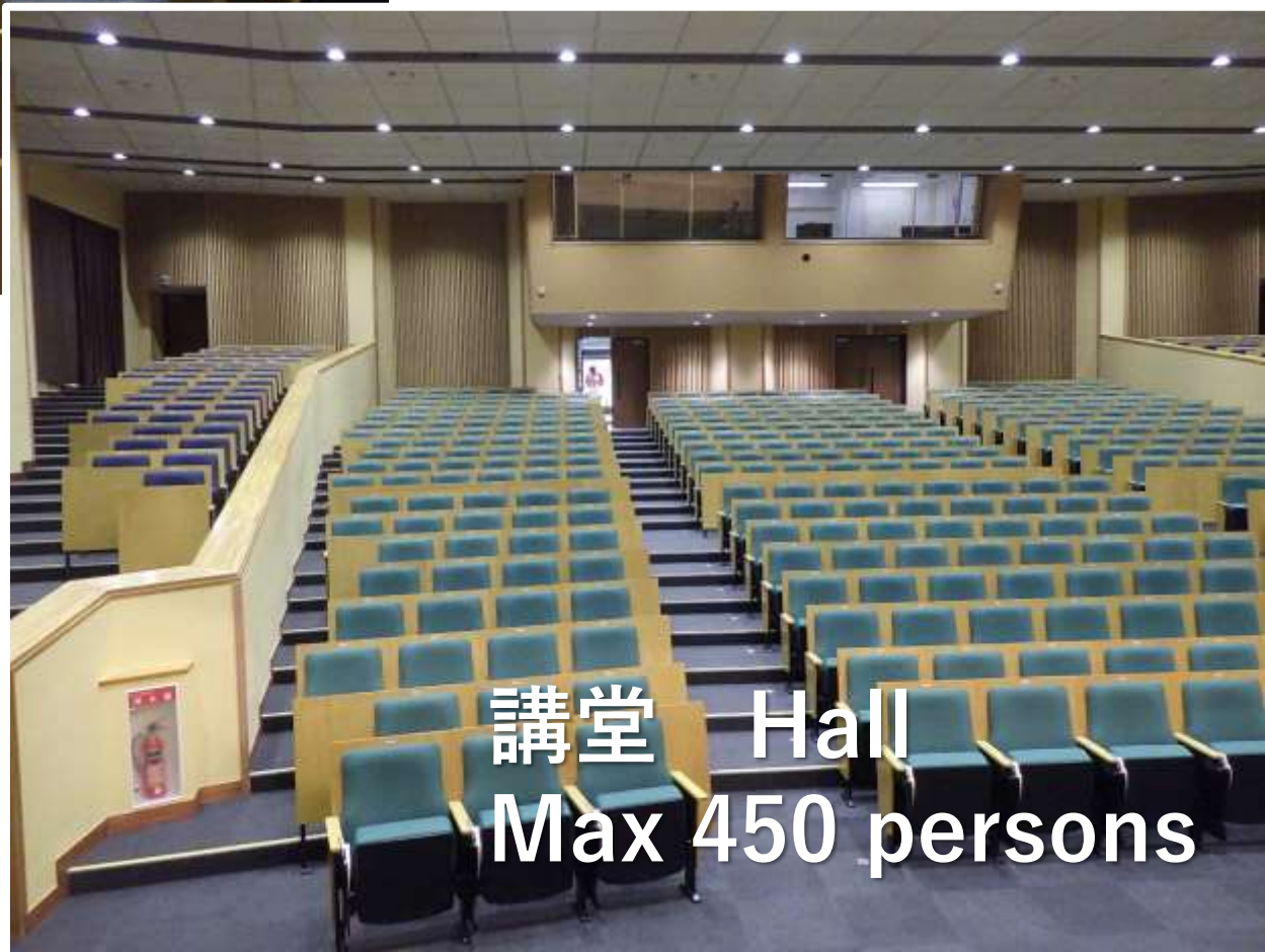
講堂 Hall Max 450 persons